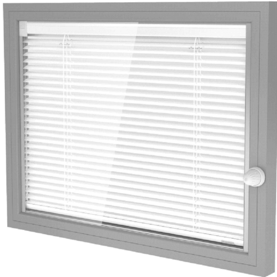
*Frame not included (for illustration purposes only) Anti-ligature knob operator shown